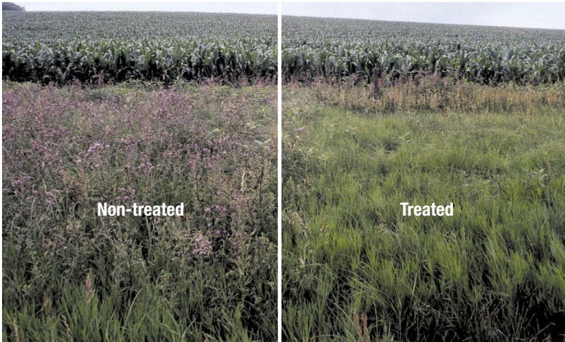
3 months after treatment Canada thistle control plot with Overdrive