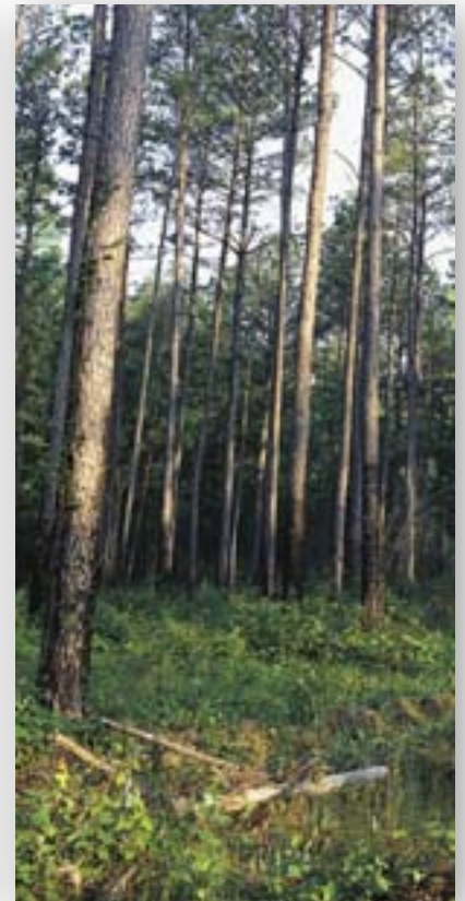
A clear understory, achieved through a treatment of Arsenal AC followed by controlled burning, allows sunlight to reach the forest floor so food plants for wildlife can flourish.